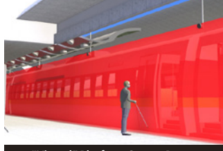
"Virtual" Platform Screen Doors