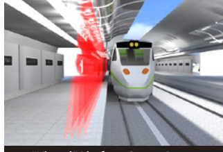
"Virtual" Platform Screen Doors