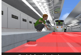
Track Safety Monitoring