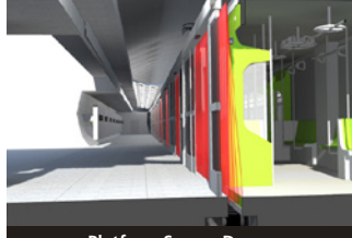
Platform Screen Doors