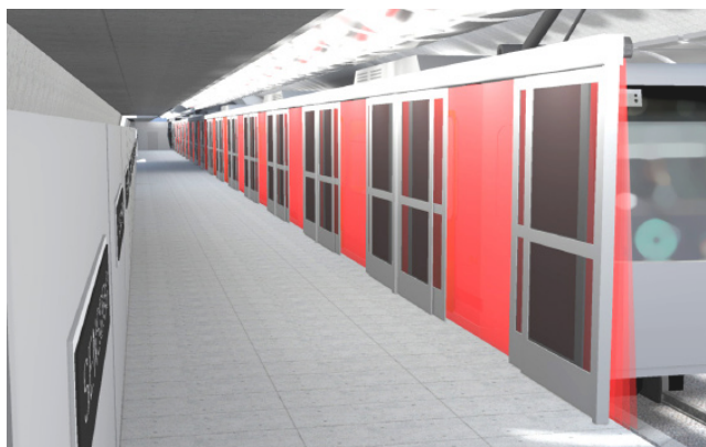
LZR ® -RS310 ■